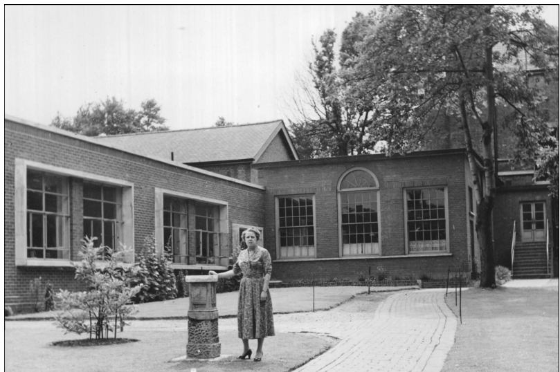
1960 –Miss Lockley proudly shows off the new Sixth Form building and Art Studio