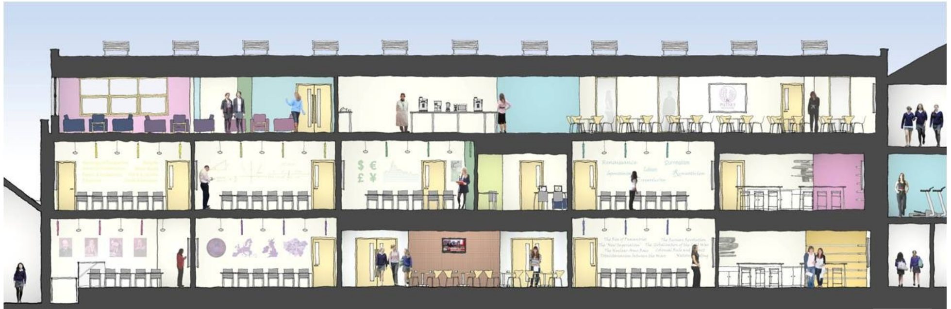
Putney High School Sixth Form Centre—cross section and key to proposed development from Putney Hill, looking east.