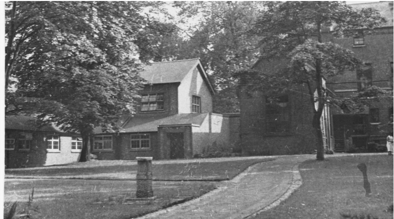
1930—the Old Studio and the Long Corridor before the Sixth Form block was conceived.