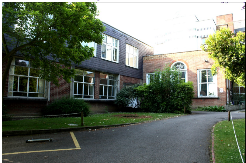
2010 - The Sixth Form Centre to be demolished this summer.